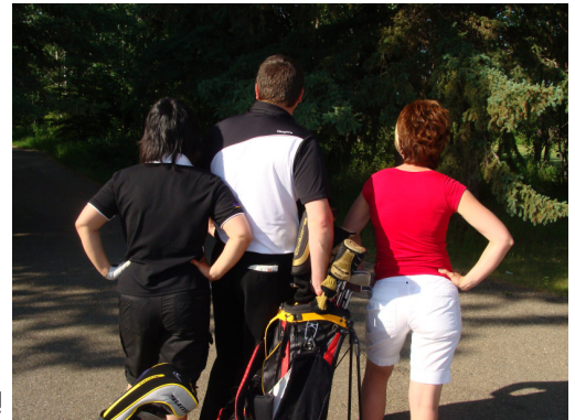
Privacy-compliant Team picture!

Partners and staff enjoyed the annual CA Golf Tournament held at the Mighty Peace Golf Club. A wonderful steak dinner with all the fixings was served up by the golf club staff.